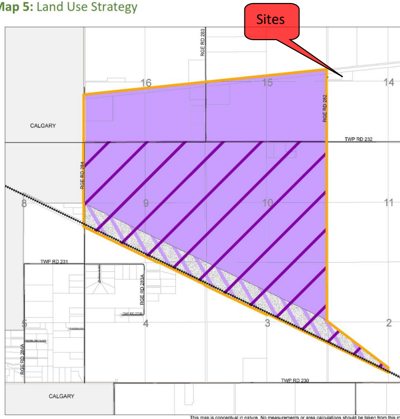
Map 5: Land Use Strategy